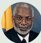
Dr. David Satcher