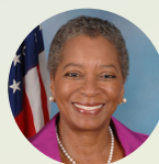
Honorable Donna Christensen, M.D. Rep-Virgin Islands (Former)