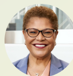
Los Angeles Mayor Karen Bass Congressional Black Caucus Chair (Former)