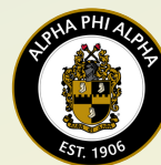
Alpha Phi Alpha Fraternity, Inc.