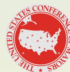
U.S. Conference of Mayors