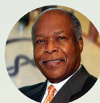
Dr. Louis Sullivan