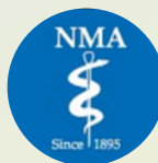
National Medical Association